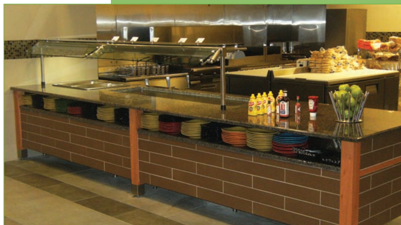
Wildfire Grille features a separate fryer and griddle for vegan fare.

Senior-level administrators, including the president, were involved in every step of the programming, design and RFP processes, he adds. "They were willing to embrace the big picture and remained focused throughout the project, which was phenomenal."