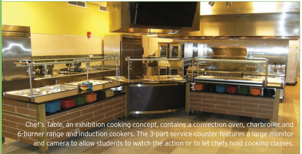
Chef's Table, an exhibition cooking concept, contains a convection oven, charbroiler and 6-burner range and induction cookers. The 3-part service counter features a large monitor and camera to allow students to watch the action or to let chefs hold cooking classes.

The lower-level bakery and catering kitchen contain dedicated and shared equipment. For example, the bakery has its own Hobart 60-qt. floor mixer, ingredient bins and work tables to prepare pastries, cookies and other baked goods. The catering kitchen features a Garland 6-burner range, Market